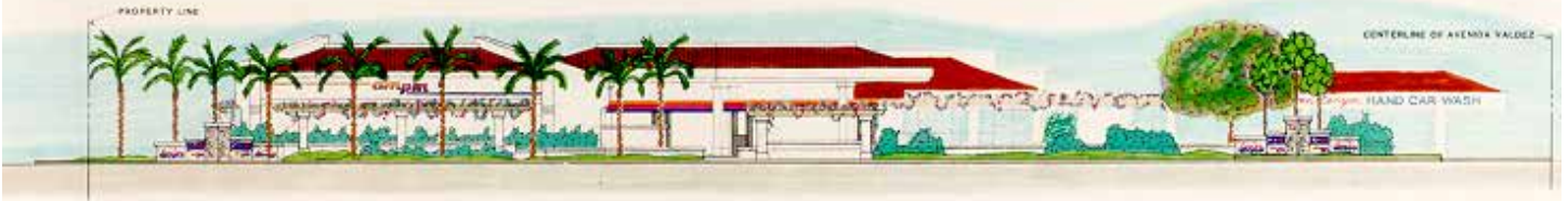
RAMON ROAD ELEVATION