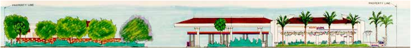
AVENIDA MARVILLA ELEVATION